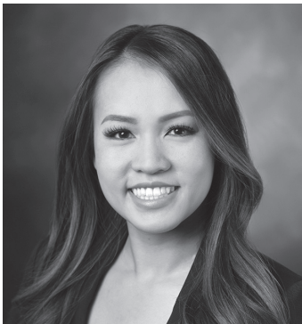
MI THAN .....